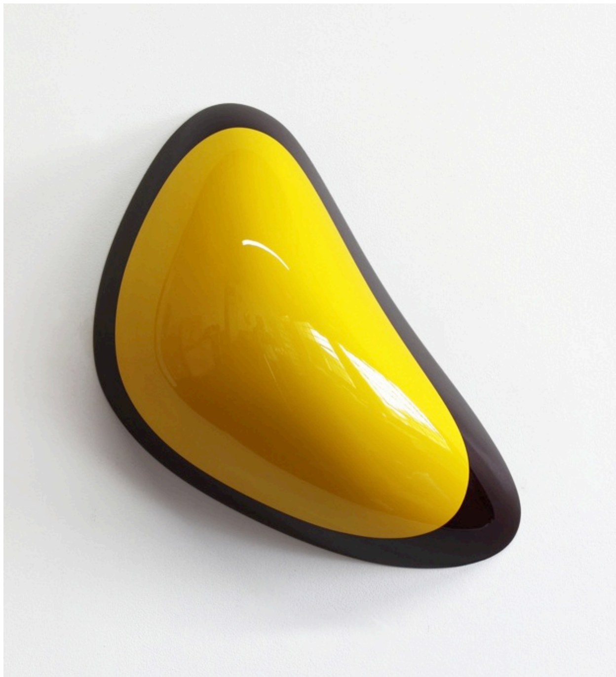
Beetle 1, 2015