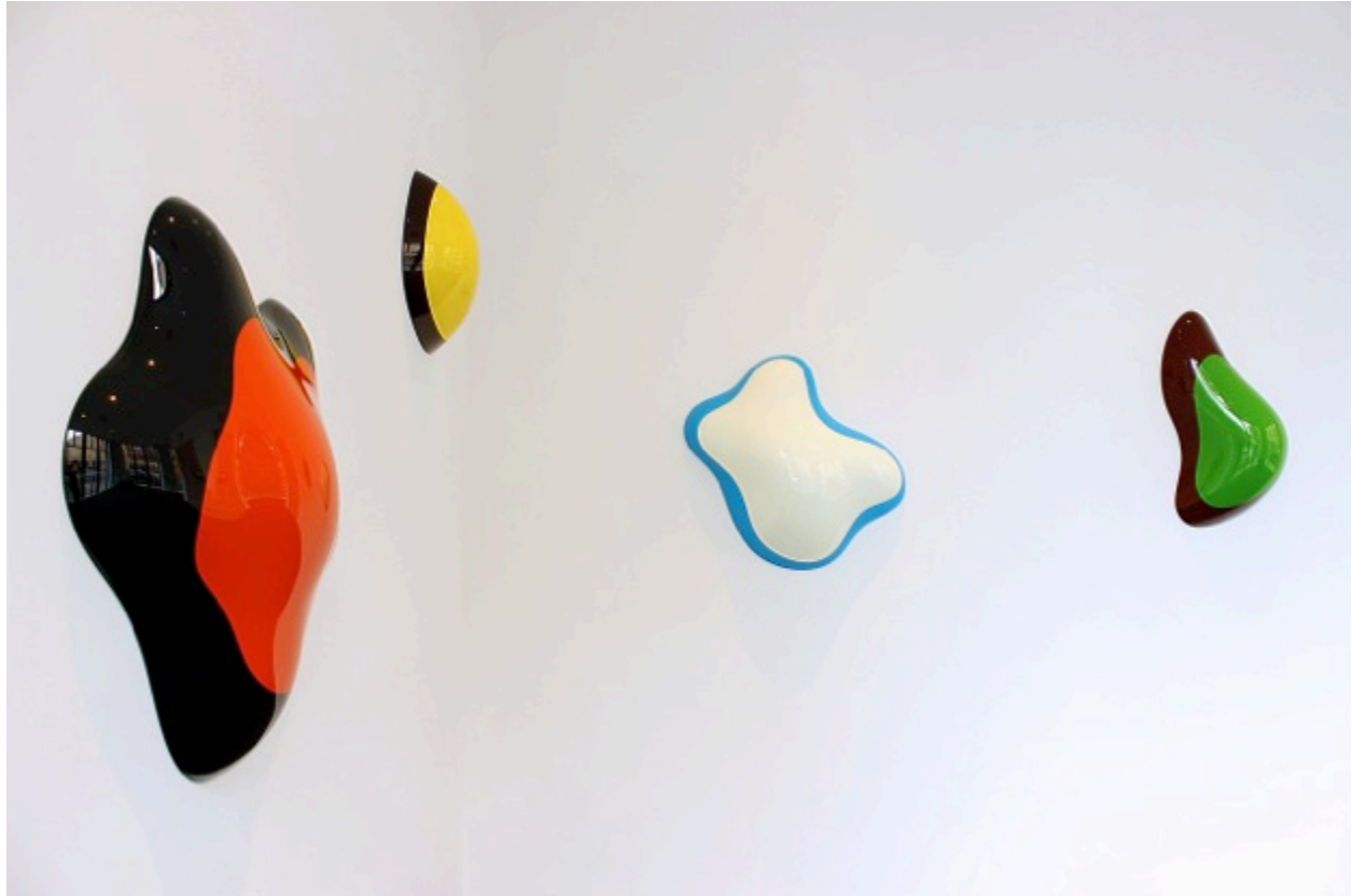
Installation view 2 Bill Thompson