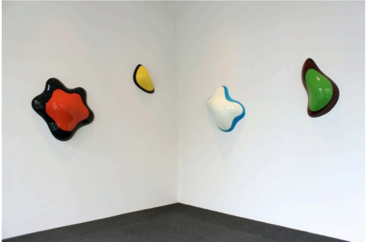
Installation view 4 Bill Thompson