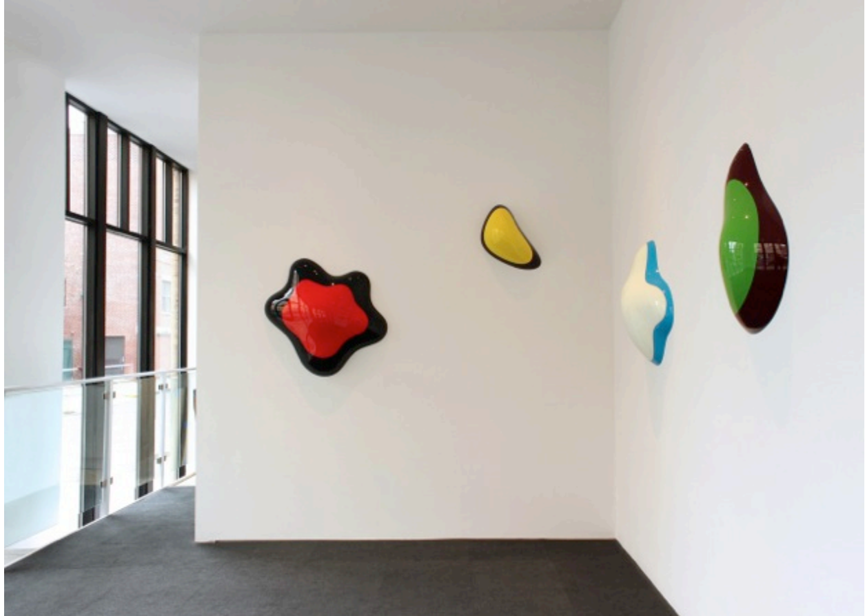
Installation view 1 Bill Thompson