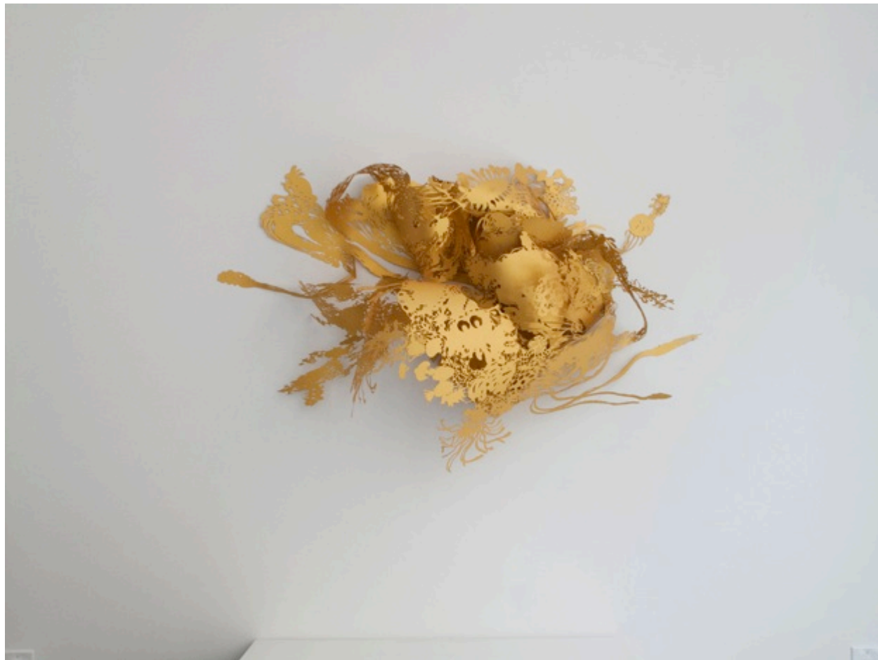
Untitled 2013 Cut paper 30 x 47 x 12"

CARROLL AND SONS 450 HARRISON AVENUE, BOSTON, MASSACHUSETTS 02118 PHONE: 617-482-2477 FACSIMILE: 617-482-2549 INFO@CARROLLANDSONS.NET