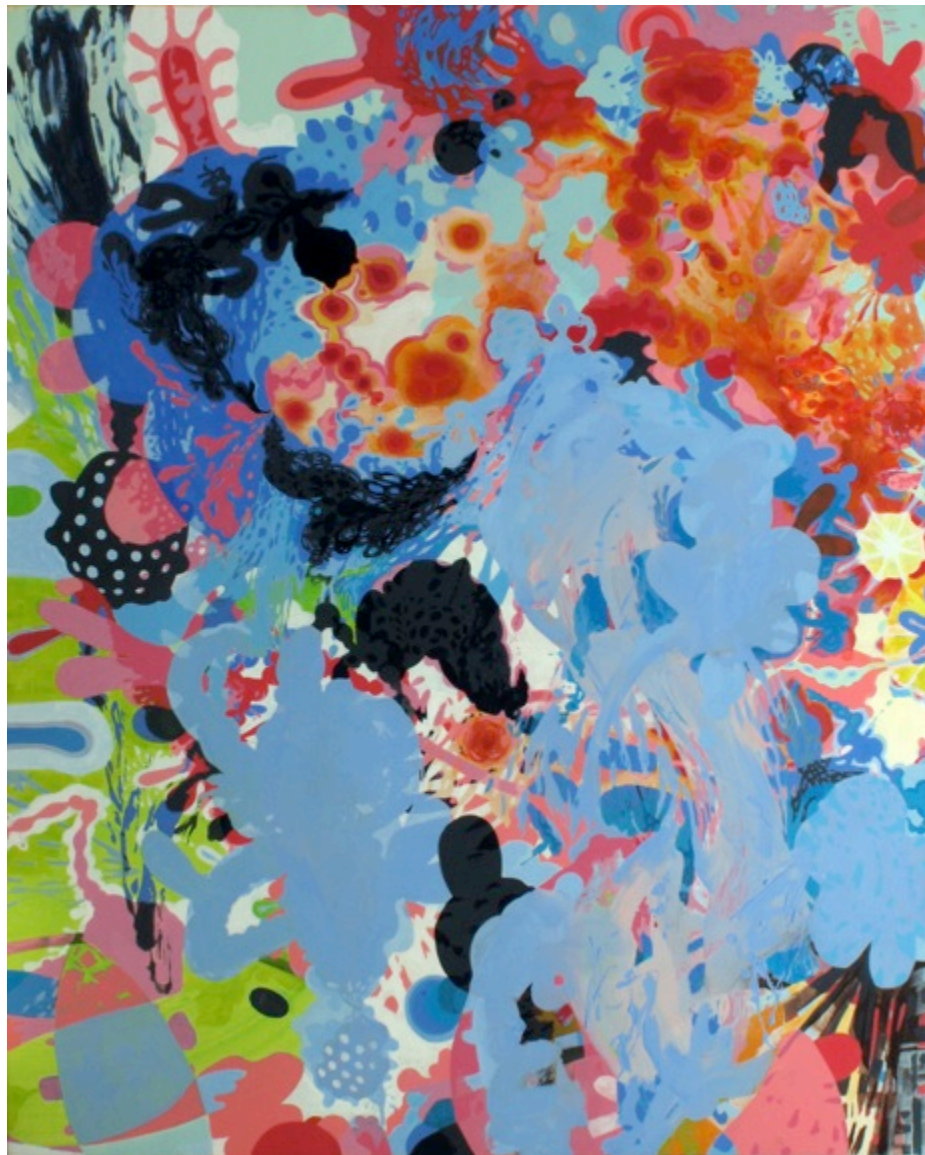
Slow River 2014 Acrylic on canvas 59 x 47"

CARROLL AND SONS 450 HARRISON AVENUE, BOSTON, MASSACHUSETTS 02118 PHONE: 617-482-2477 FACSIMILE: 617-482-2549 INFO@CARROLLANDSONS.NET