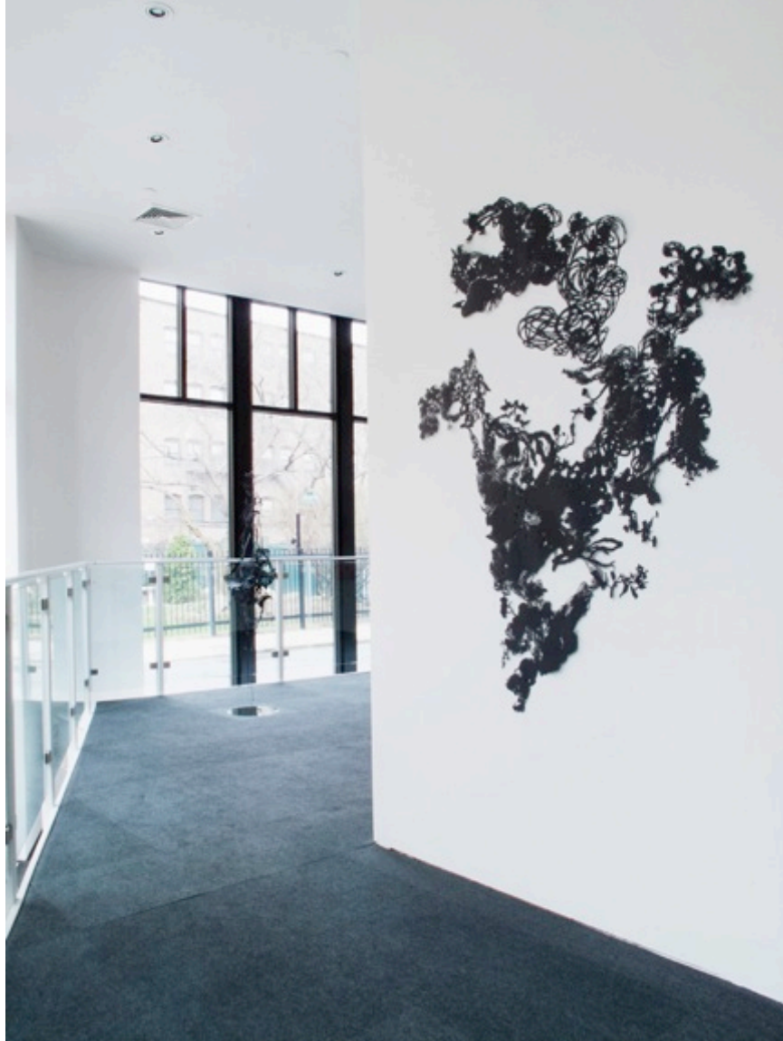
Migration Sound 2013 Cut paper 67" x 51"

CARROLL AND SONS 450 HARRISON AVENUE, BOSTON, MASSACHUSETTS 02118 PHONE: 617-482-2477 FACSIMILE: 617-482-2549 INFO@CARROLLANDSONS.NET