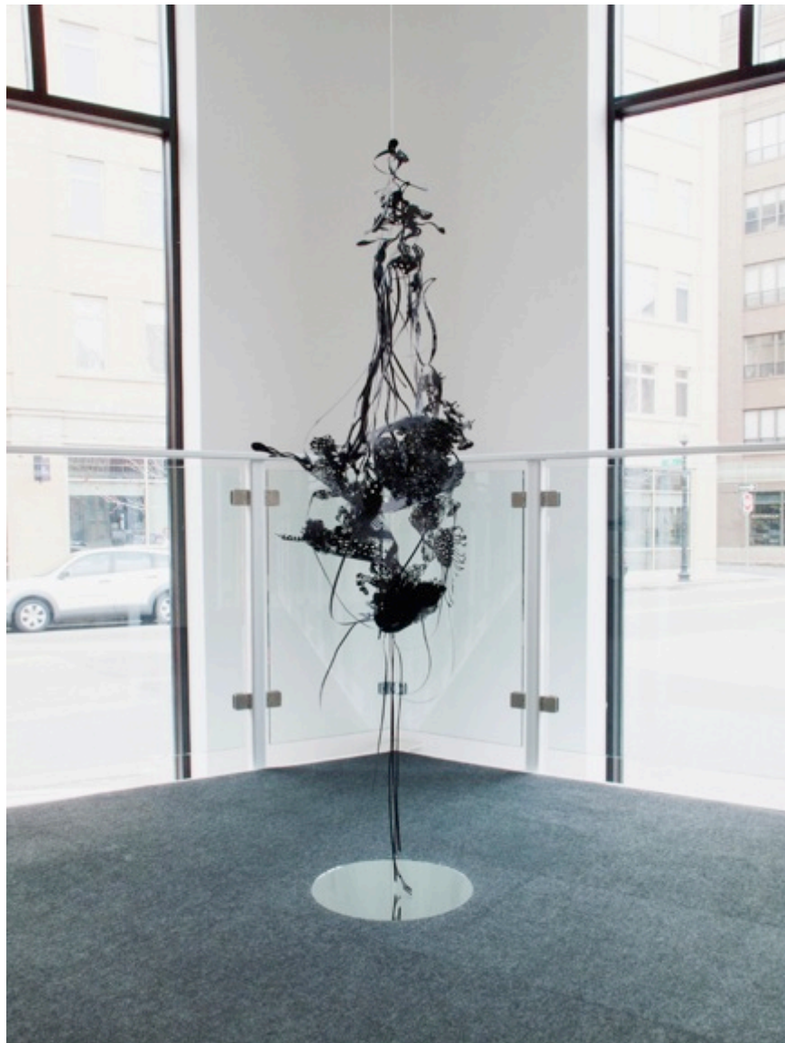
Shallow Water, Deep Dream 2013 Silkscreen on cut paper, mirror 67 x 22 x 22"

CARROLL AND SONS 450 HARRISON AVENUE, BOSTON, MASSACHUSETTS 02118 PHONE: 617-482-2477 FACSIMILE: 617-482-2549 INFO@CARROLLANDSONS.NET