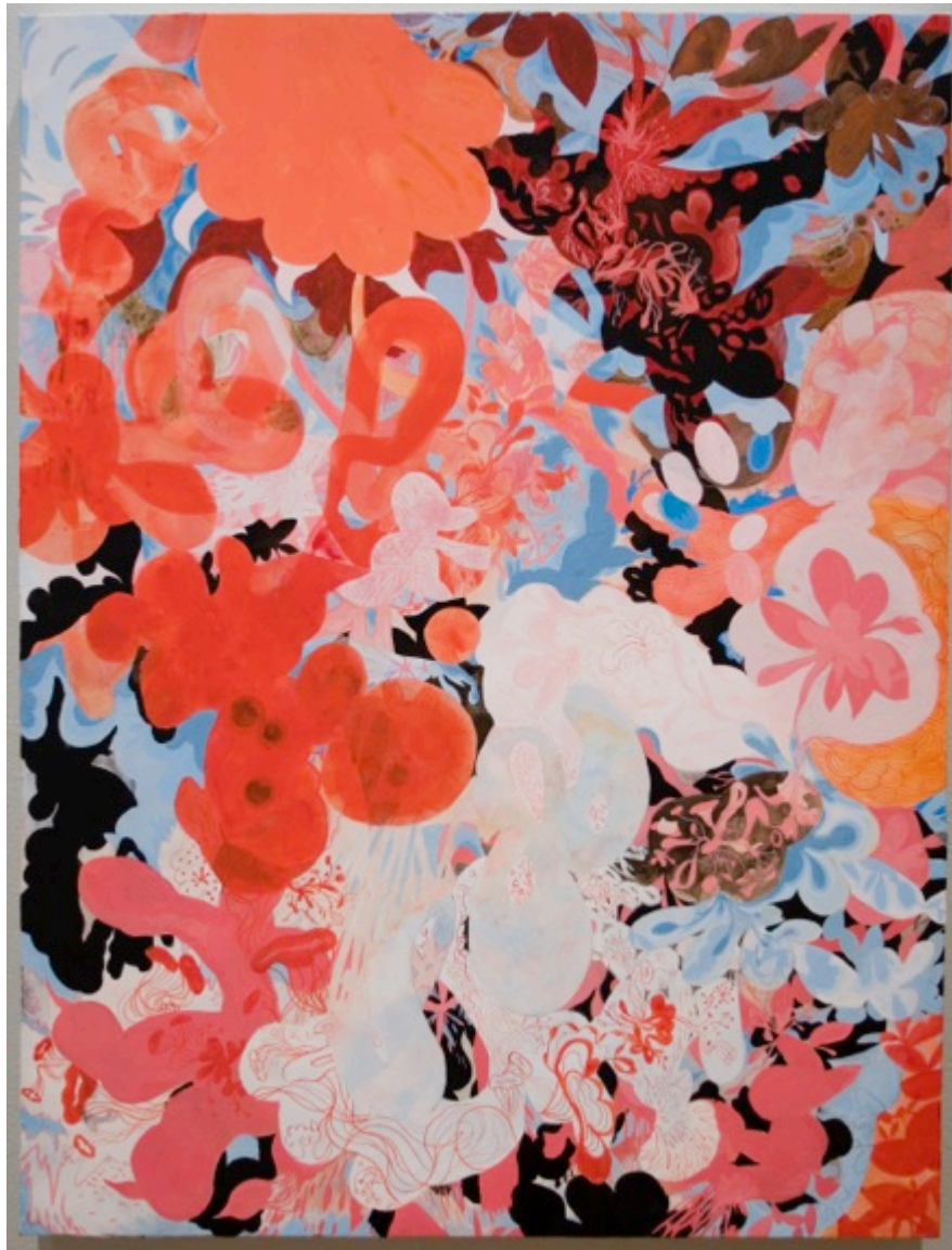
Seed in the Partridge 2010 Gouache, acrylic on prepared panel 24 x 18"

CARROLL AND SONS 450 HARRISON AVENUE, BOSTON, MASSACHUSETTS 02118 PHONE: 617-482-2477 FACSIMILE: 617-482-2549 INFO@CARROLLANDSONS.NET