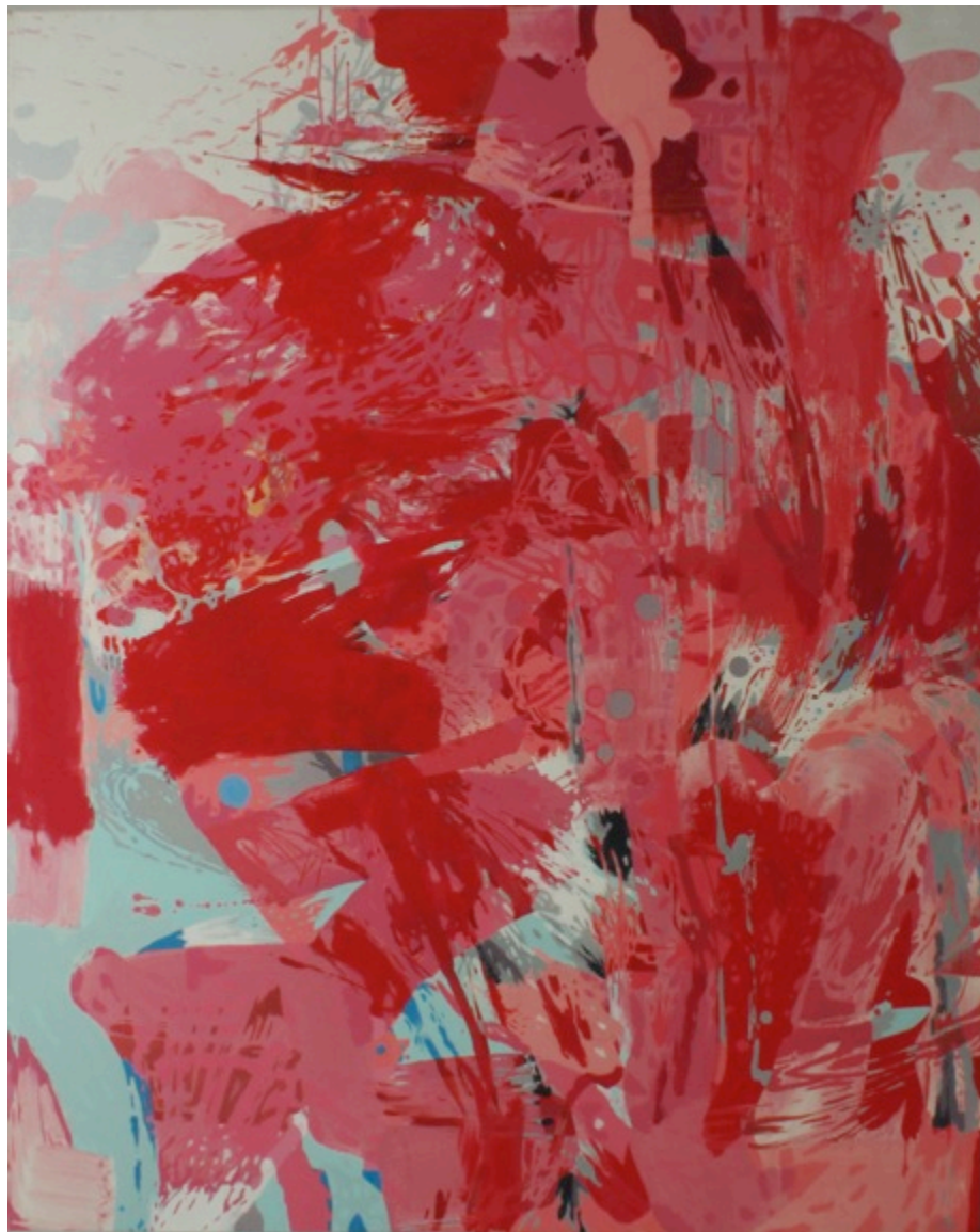
Convivial Chaos 2014 Acrylic on canvas 59 x 47"

CARROLL AND SONS 450 HARRISON AVENUE, BOSTON, MASSACHUSETTS 02118 PHONE: 617-482-2477 FACSIMILE: 617-482-2549 INFO@CARROLLANDSONS.NET