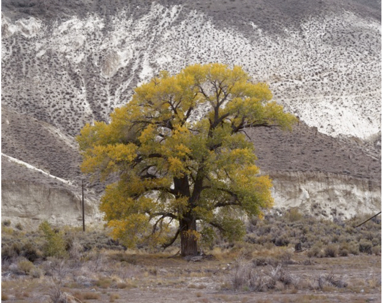
Cottonwood Under Chalk Bluff by the Truckee River, Washoe County, Nevada